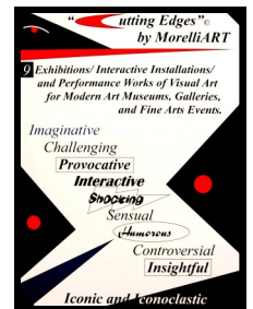
"Cutting Edges" Contemporary Art Exhibitions