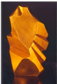
"Odyssey" Series maquette for monumental bronze.