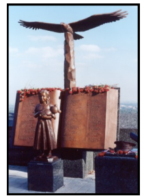
"Eagle Rock September 11th Memorial" overlooking the site of the Twin Towers West Orange, New Jersey

Sculpture, Painting, Architectural Design, National Monuments Public Presentations, Contemporary and Classical Art Exhibitions, University Teaching, Guest Lectures and Seminars.