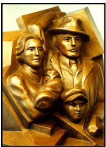
"America the Beautiful"/ "La Bellissima America" Sculpture