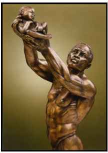
"Behold" Monument to Dr. Martin Luther King, Jr. King National Historic Site Atlanta, Georgia

Sculpture, Painting, Architectural Design, National Monuments Public Presentations, Contemporary and Classical Art Exhibitions, University Teaching, Guest Lectures and Seminars.