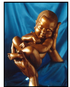
"Behold" Infant Smithsonian Institution American Art Museum